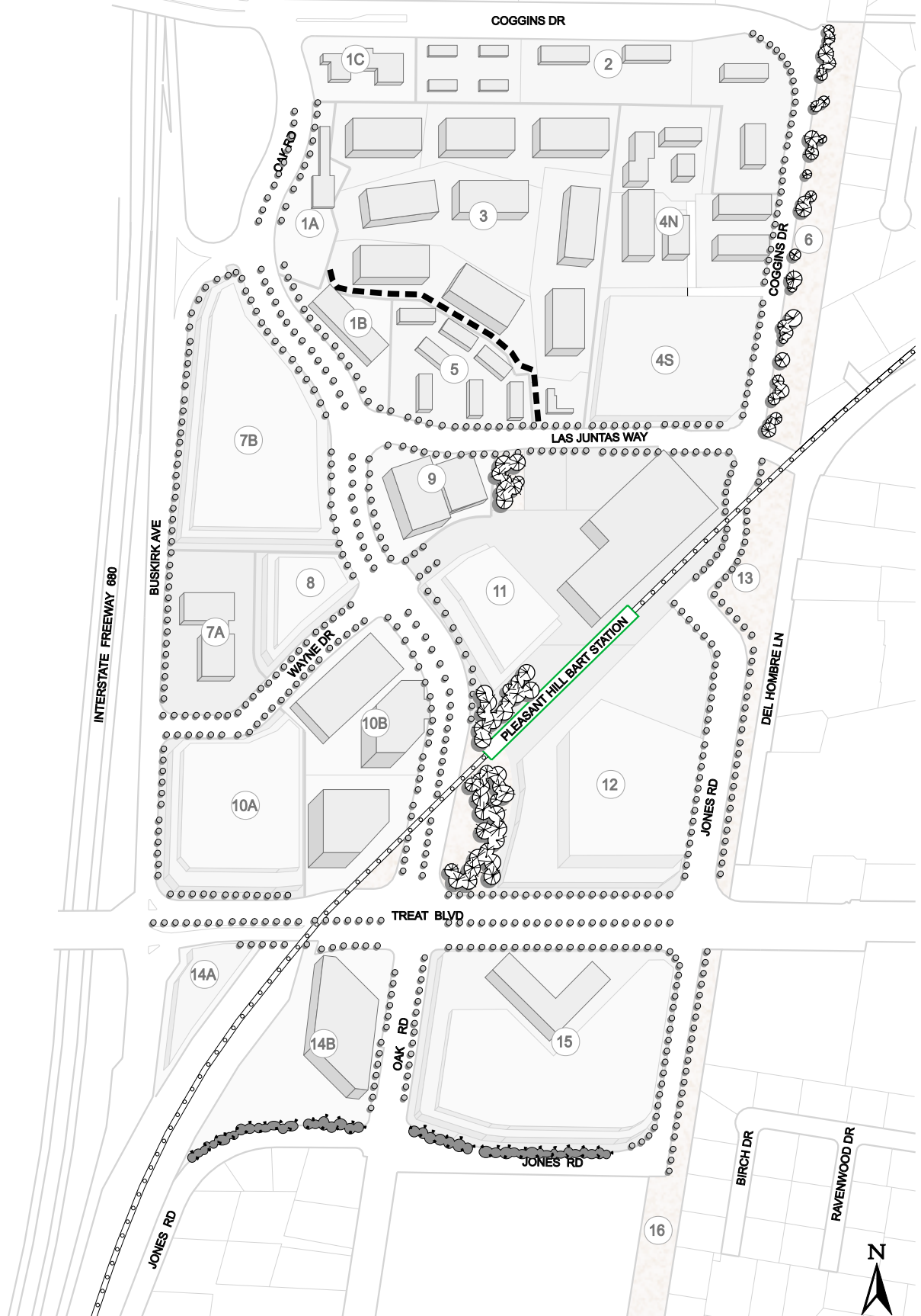
Figure 7.4 OPEN SPACE & LANDSCAPE