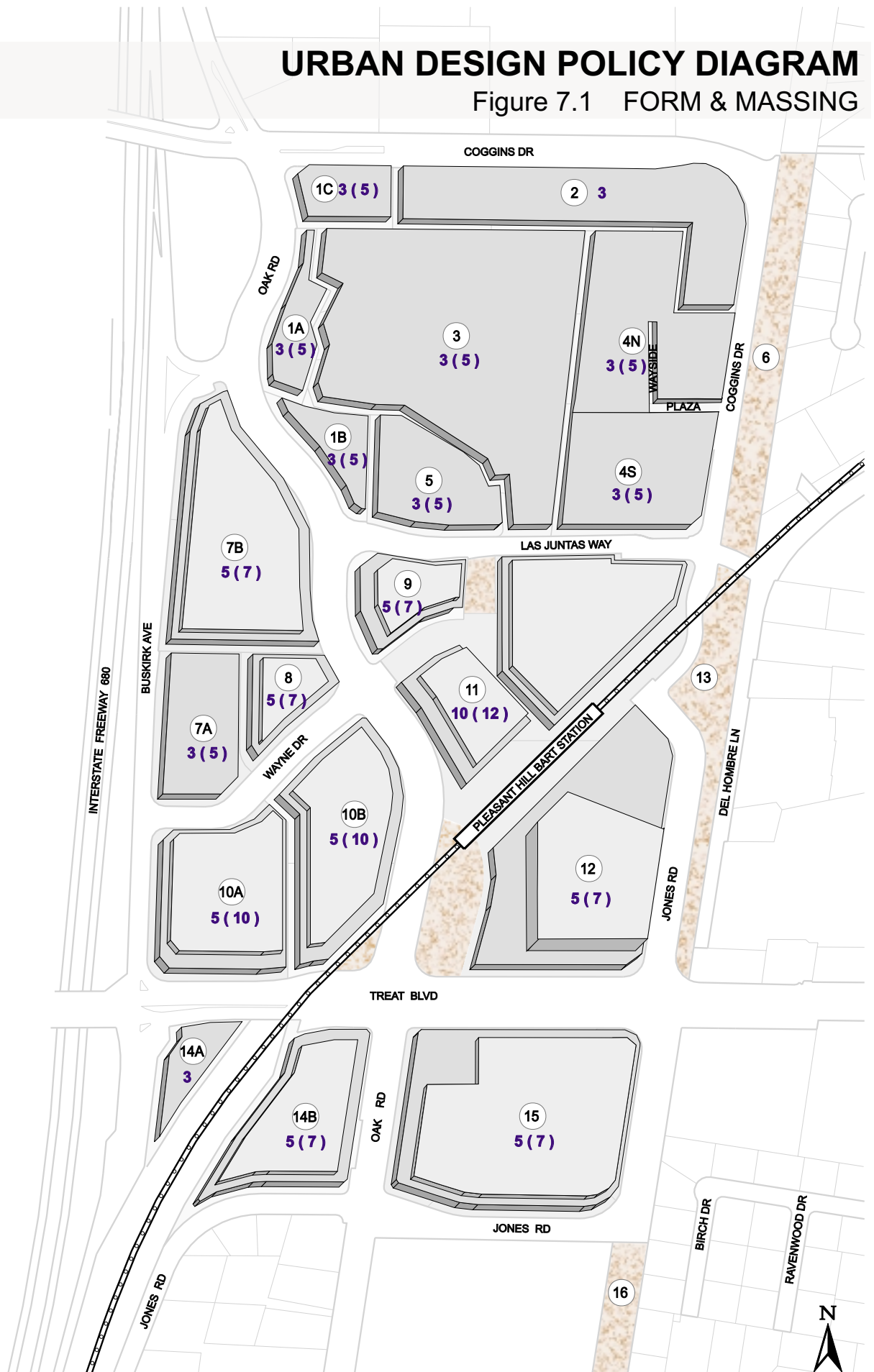
Figure 7.1 FORM & MASSING